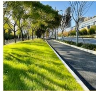
Roadside green belt

Powerful, maneuverable, and built for long-lasting efficiency, our zero-turn lawn tractor handles every lawn care scenario, from private estates and resort grounds to public parks and highway green belts. Designed to save time and reduce labor, it delivers professional-grade performance, making it the ideal investment for anyone needing reliable, high-speed lawn maintenance.