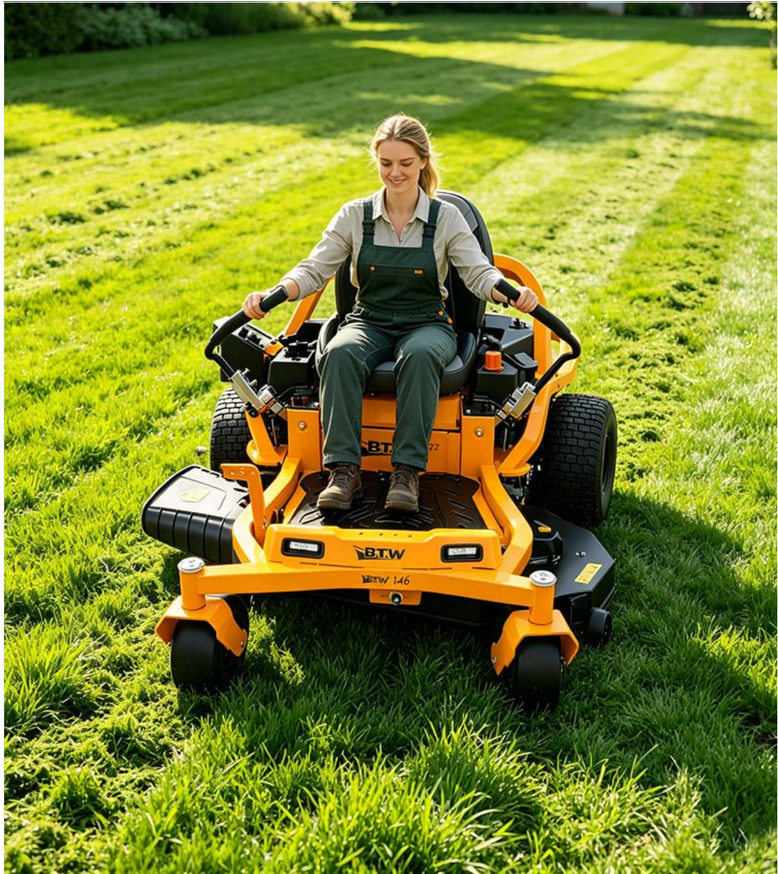
Xinghu XH-46 46 Inch Commercial Zero Turn Mower, Gas Powered Zero Turn Riding Lawn Mower with Loncin Engine, 26HP ,Hydrostatic Zero Turn Lawn Mower for Large Yard & Professional Use