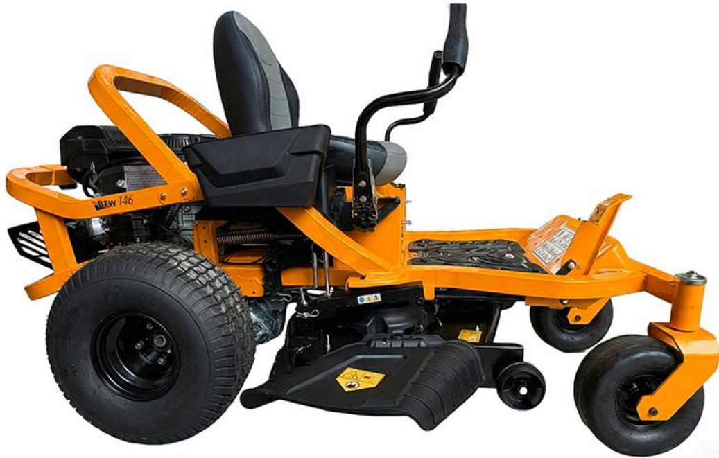
Factory Supply XH-46 46 Inch 26hp Zero Turn Lawn Mower, Gas Powered Commercial ZTR Riding Mower for Garden Park Farm Use